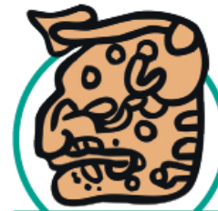
The Maya logogram for b'alam – jaguar

The Maya writing system, used to write several different Maya languages, was made up of over 800 symbols called glyphs. Some glyphs were logograms, representing a whole word, and some were syllabograms, representing units of sound. They were carved onto stone buildings and monuments and painted onto pottery. Maya scribes also wrote books, called codices , made from the bark of fig trees. Only priests and noblemen would know the whole written language.